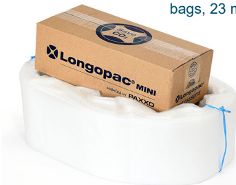
432177 Longopac plastic bags , 23 m /75 ft. Set of 4.