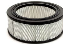
44016-1 HEPA H 13 filter made of cellulose and fibreglass