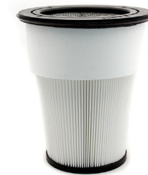
44017-2 Fine filter made of polyester