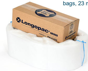
432177 Longopac plastic bags , 23 m /75 ft. Set of 4.